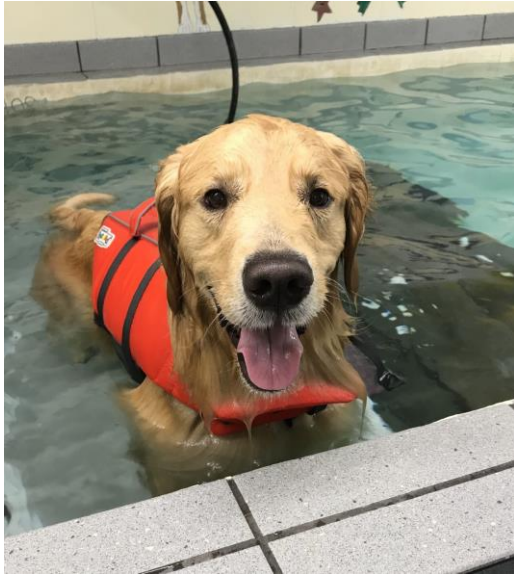
Underwater treadmill helps build muscle and improve body condition