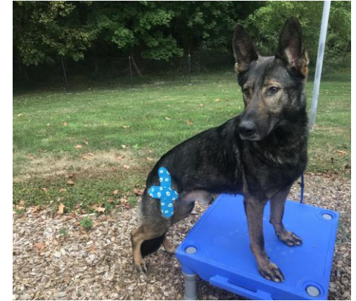
Rock tape therapy helping with body awareness to improve muscle building

Rock tape is used in conjunction with cold laser therapy and underwater treadmill. It lifts the skin and fascia which improves the space between muscle bellies and skin which allows the body to have better circulation.